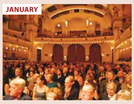
As a part of all-state finance collection we organize beneficial concert in Stavovské theatre.