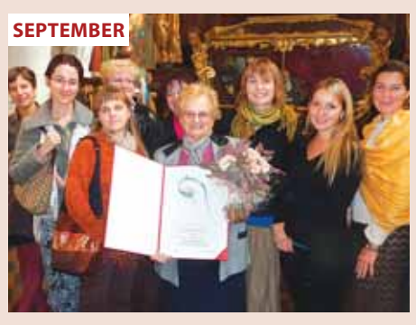
Social worker of the Development Centre of Caritas Prague receives award of the Caritas.