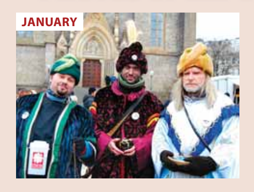
We organize the Three-Kings Collection as a help for needy in the Czech Republic.