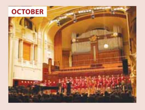
We organize for our donors 19<sup>th</sup> benefit concert in Obecní dům in Prague.