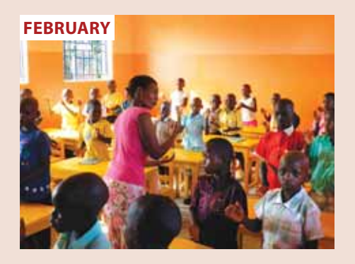
We begin teaching at a new Czech primary school of St. John of Nepomuk in Uganda.