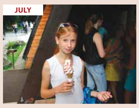
Organizing of holiday for Belarusian children in the Czech Republic.