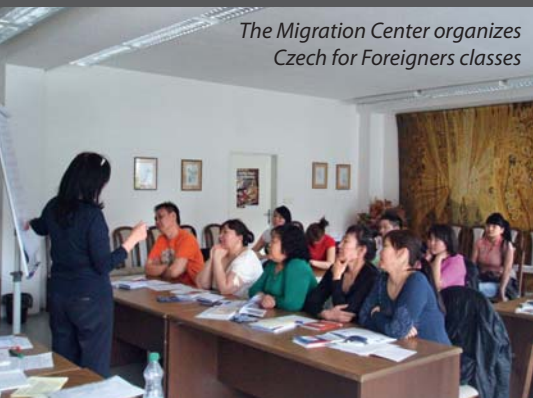
The Migration Center organizes Czech for Foreigners classes